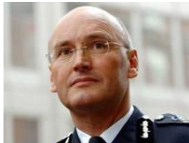
Sir Paul Stephenson QPM

We are pleased to announce that following his appointment as Met Commissioner, Sir Paul Stephenson has agreed to join us as President of Safer London Foundation.