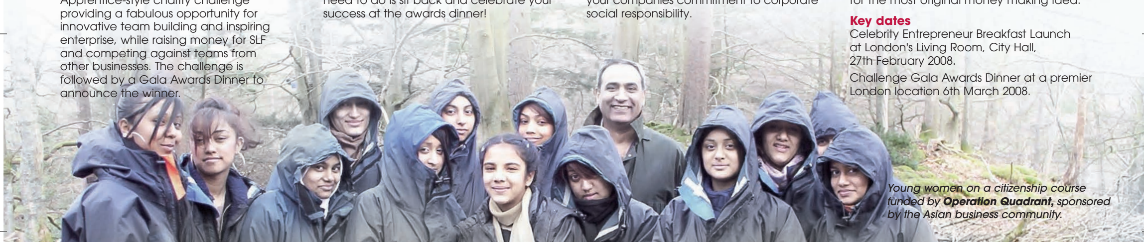
Young women on a citizenship course funded by Operation Quadrant , sponsored by the Asian business community.

Challenge Gala Awards Dinner at a premier London location 6th March 2008.